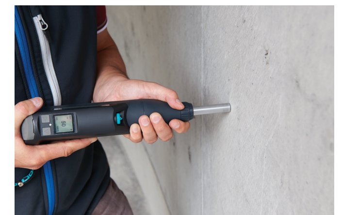
Original Schmidt Live with digital display