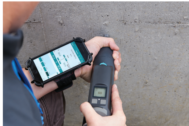
Original Schmidt Live with iOS app