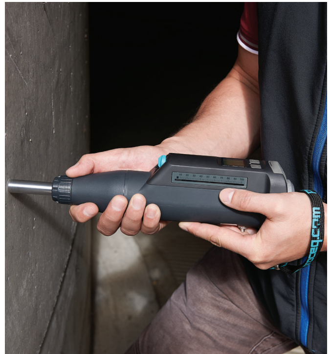
Original Schmidt Live with wristband

When acquiring a new instrument, max. 3 additional warranty years can be purchased for the electronic portion of the instrument. The additional warranty must be requested at time of purchase or within 90 days of purchase.