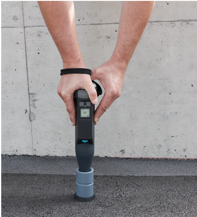
Original Schmidt Live with portable testing anvil