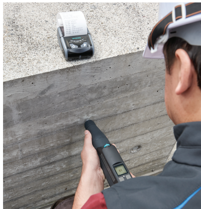
Original Schmidt Live Print with Bluetooth printer